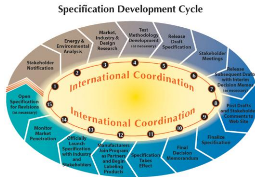
Figure 2. US EPA ENERGY STAR Specification Development Cycle

Manufacturers who wish to use the ENERGY STAR label must agree to a set of partner commitments, test their products per specified testing procedures and self-certify that their products meet the ENERGY STAR guidelines for that product category. Manufacturers are required to submit test results to the US EPA or the European Commission, as appropriate, and to submit periodic updates. To the extent ENERGY STAR is a self-certification program, the US EPA relies on the integrity of participating companies to ensure all products for which ENERGY STAR claims are made meet all aspects of the ENERGY STAR performance specification. The product partner commitments and product specifications for all categories are posted on the ENERGY STAR website. For more information about ENERGY STAR, visit the program's website at www.energystar.gov (ENERGY STAR 2008).