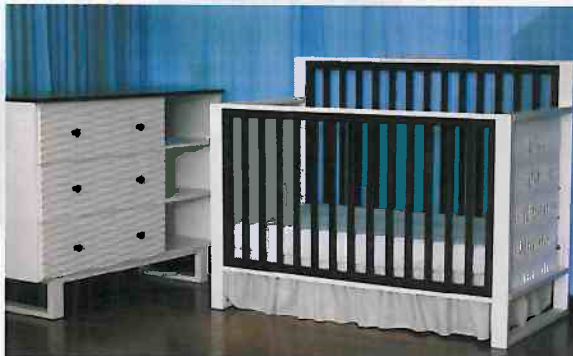
Edén Baby's Moderno collection features a wave cutting design on the side panels of the crib and dresser front. The pieces are made with hardwood and sport a white and espresso two-tone finish. The crib, $399, has three adjustable mattress levels, and includes a toddler bed guard rail for conversion (a full-size bed conversion kit sold separately). The dresser, $499, has three deep drawers with dove-tail construction, a bottom dust board, and it's the right height for a changing pad or TV, edenbaby.com, 714-997-9772.