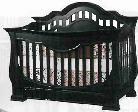
The Beaumont crib coordinates with Baby Appleseed's Davenport collection. It has a drawer underneath and converts to a toddler and full size bed, $799 (conversion kit sold separately), babyappleseed.com, 626-333-1919.