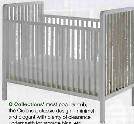
Q Collections' most popular crib, the Cielo is a classic design – minimal and elegant with plenty of clearance underneath for storage bins, etc. Handmade in the USA, it's Green-guard certified. It has fixed side rails and a four-height adjustment mattress support, $1,180, qcollectionjr.com, 212-529-1400.