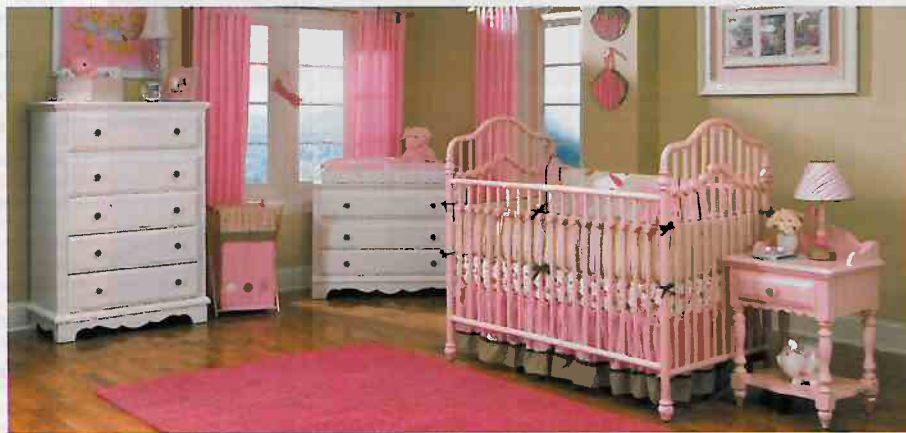
Lea Furniture's Spring Garden collection includes a metal crib in pink, white or yellow, $600. leaindustries.com , 336-294-5233.