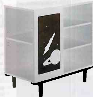
The Ray storage unit by Muu , $795, shown here with walnut legs and "Blastoff" MuuPanel, accommodates the Ray changing tray on top. $125. muukids.com , 800-732-9767.