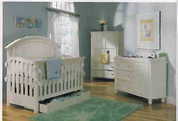
The cottage-style Summer Breeze Grow With Me convertible crib from Legacy Classic Kids is made from select hardwoods in a white finish, $499, legacyclassickids.com, 336-449-4600.