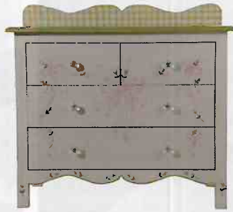
A symphony of swirling ribbons and roses decorate the hand-painted Provence chest and change tray from Australia's Miss Tati . With an antique wash finish, the sides are green gingham. The chest comes in three sizes. $950 to $1,150 and changer is $125. misstatiandfriends.com , 613-9817-4482.

On the flip side, Young America announced late last year that its furniture