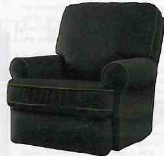
Best Home Furnishings has added a Power Rocker mechanism to many of its recliners, like Tryp, for whisper-smooth motion at the touch of a button. Tryp has a semi-attached back blown with high-loft premium cushioning fibers, and seat is high-density foam, bestchairs.com, 812-367-8453.