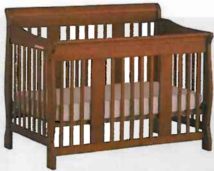
The Tuscany 4-in-1 Stages crib in oak by Stork Craft has a sleigh design. It has stationary sides and converts to a toddler bed, daybed and full-size bed, storkcraft.com, 604-274-5121.