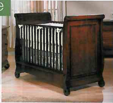
The Verde fixed-gate crib from Capretti includes a drawer and toddler rail, and is available in amaretto, espresso, merlot, natural and snow, $1,799, caprettihome.com, 954-385-8318.