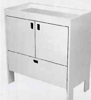
The Eicho changing station from Spot On Square has an iconic, minimalist look with an affordable price tag to match. Made of 100% recycled/reclaimed and no formaldehyde added MDF, it is offered in a bright white non-toxic finish. $675. spotonsquare.com , 800-308-0046.