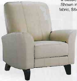
This Comfort Recliner 302 from the Dutailier Prestige Collection reclines and glides. Featuring an innovative patented glide feature, it does not compromise the smoothness of the reclining and gliding mechanisms, for a combination of the modern look of a trendy chair, the optimal comfort of a recliner and the relaxing motion of a glider, $949, dutailier.com, 800-363-9817.