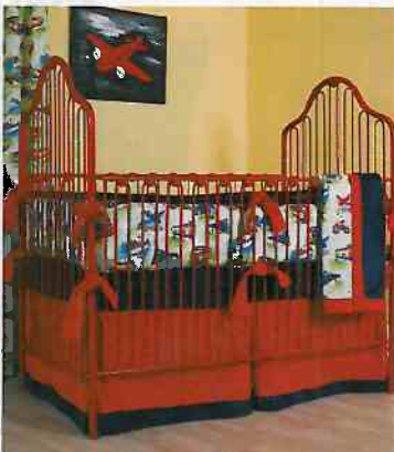
Corsican's Harmony 6862 crib is made of fine cast iron and has a stationary side rail, $2,215, corsican.com, 800-421-6247.