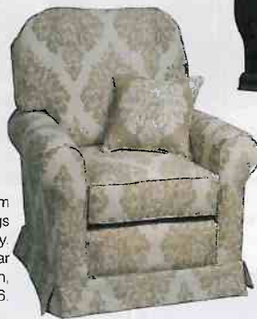
The Buckingham glider from Little Castle Furniture brings a classic styling to the nursery. Shown in the luxurious Palimar fabric, $649, littlecastleinc.com, 805-278-4646.