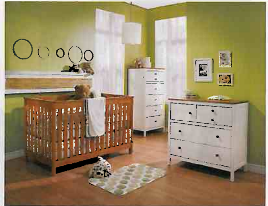
Lollipop from AP Industries is available in all finishes. The crib has three mattress heights and converts to a daybed, apindustries.com, 800-463-0145.