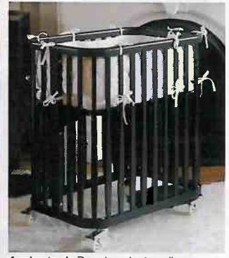
Argington's Barn bassinet easily converts to a crib. It is compact and on casters for mobility. It comes with a machine washable, 1-inch foam mattress pad covered in soft quilted cotton and two soft organic white sheets. Bassinet is available in ebony or white, $359, or bamboo, $499. The conversion kits are $329 and $425, argington.com, 800-482-0522.