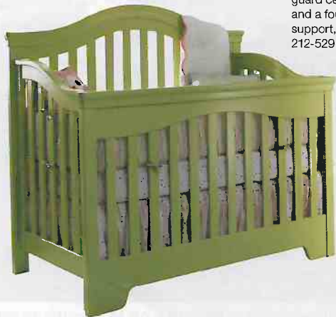
Young America's Built to Grow 2000 slat crib, shown in seagrass, can mix and match with the MyHaven collection, youngamerica.com, 276-627-2000.