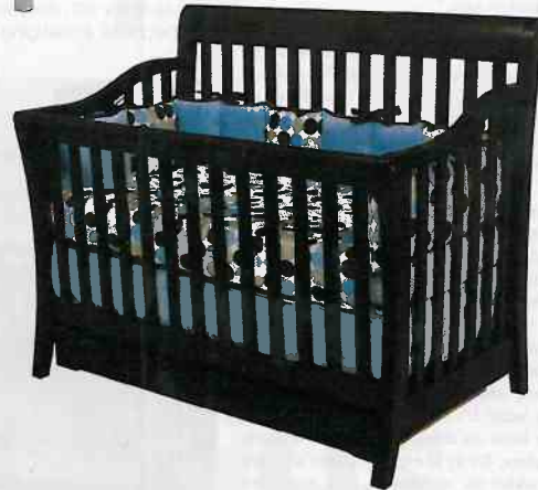
Million Dollar Baby's Marlowe 4-in-1 Crib is made from New Zealand pine. The mattress can be adjusted to four levels, and uses the company's standard crib mattresses up to 6-inch thick with the crib, toddler bed and day bed. Crib includes a guard rail and under-crib drawer. Separate conversion kit turns it into a full-size bed, $399, milliondollarbaby.com, 323-728-8988.